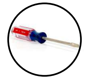
Slotted Screwdriver (To remove Drain